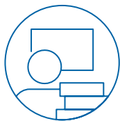
Representatives of university professors