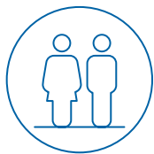
Representatives of the general university staff

The Equal Opportunities Working Party represents all university members and has an even balance of members from all groups of university members and from all faculties/centres.