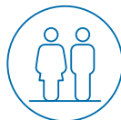
Representatives of the general university staff

The Equal Opportunities Working Party represents all university members and has an even balance of members from all groups of university members and from all faculties/centres.