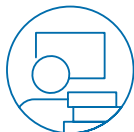
Representatives of university professors