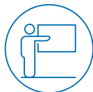
Representatives of associate professors as well as of the academic university staff in the area of research and teaching